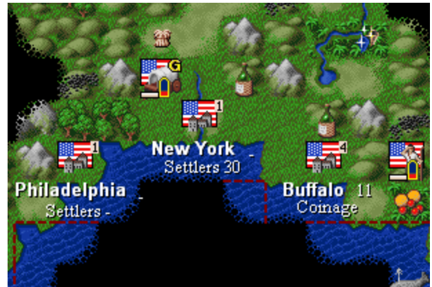
Figure 1: Freeciv

Freeciv is an open-source turn-based strategy game modeled after Sid Meier's series of Civilization™ games (Freeciv, 2006). The objective of the game is to start a civilization from initial settlers in the Stone Age and expand and develop it until you either conquer the world or win the space race and escape to Alpha Centauri. In either case, the game can be characterized as a race to build your civilization and technological sophistication faster than your opponents. Along the way, there are many competing demands for limited resources, investment, and development. For example, players must improve terrain with irrigation and roads, while avoiding famine and military defeat. Too much emphasis on military preparedness, for example, can make citizens unhappy and therefore less productive. Money must be allocated to research into new technologies, such as iron-making and democracy, which enable players to create new improvements to cities, new types of units, and adopt new types of governments, each with their own tradeoffs.